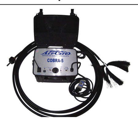
(Ref#27) Sidewinder Hose Assembly