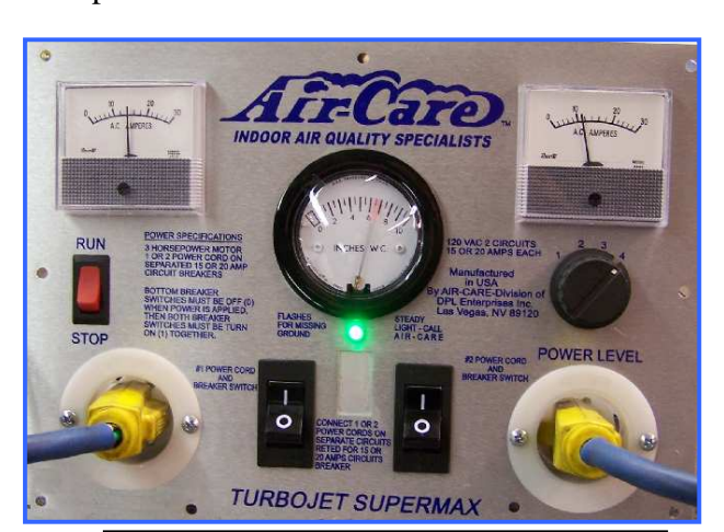
Panel shows with "GREEN" status Light, 2 power cords connected, Power Level #4 (3 HP), Running (6" Static Pressure)